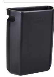
8 Gallon (30,3 L) Large Quick Connect Bins