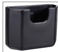
2.5 Gallon (9,5 L) Small Quick Connect Bin

Shown with optional Quick Connect Bins on each end of the cart.