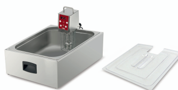
Container 2/1 gastro