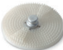
Piatti puliscicozze Mussel washer plates