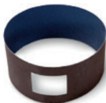
Tela abrasiva Abrasive wall