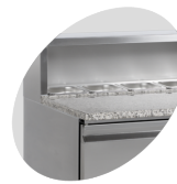
GN1/6 refrigerated cooling well