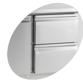
Drawers as option